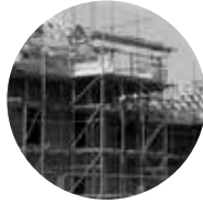
CITB Training Courses